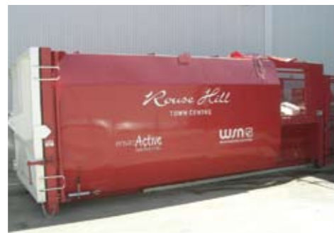
One of the new compaction units installed by WSN at Rouse Hill Town Centre.