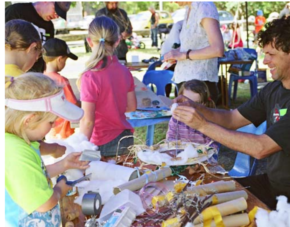
Participants in the Riverworks sculpture competition get creative.

WSN's Grass Roots Sponsorship Program was developed to support and promote projects that contribute to environmental sustainability and benefit the local community. An event showcasing each of the 23 successful projects and launching next year's grants program will be held in July. Here is an update on two of the projects.